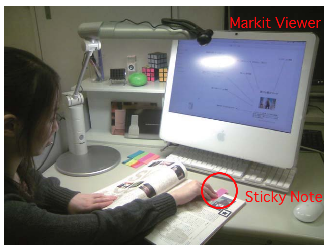
Figure 1. Markit overview: Collecting paper articles as digital information by using sticky note metaphor

Markit enables users to collect paper-based information as digital information without tedious task such as using scanner and classifying scanned data manually. As illustrated in Figure1, for successful clipping the paper article as the digital media, users only need to put a sticky note near the article which the user wants to clip. Then Markit system recognizes the article and stores it automatically. The user can classify the articles by using distinct color of sticky notes. The user registers the correspondence of colors and genres beforehand. We are familiarized with putting sticky note for managing the articles. Therefore, Markit provides easy and intuitive way to collect paper information digitally.